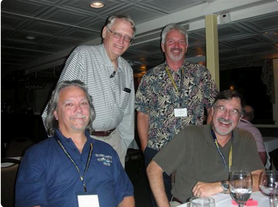
SSBN 657 Francis Scott Key Reunion 2012